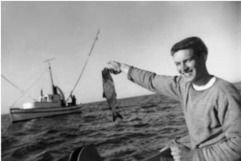
First catch of the day.

The only OK conversation was about fishing. Wives and girlfriends weren't talked about, except when they connected to fish. ("Tanya always overcooks pollack.") Politics weren't discussed, but maybe should have been, considering what politicians later did to fishing — and were doing then, almost unnoticed. Sports and cars weren't mentioned.