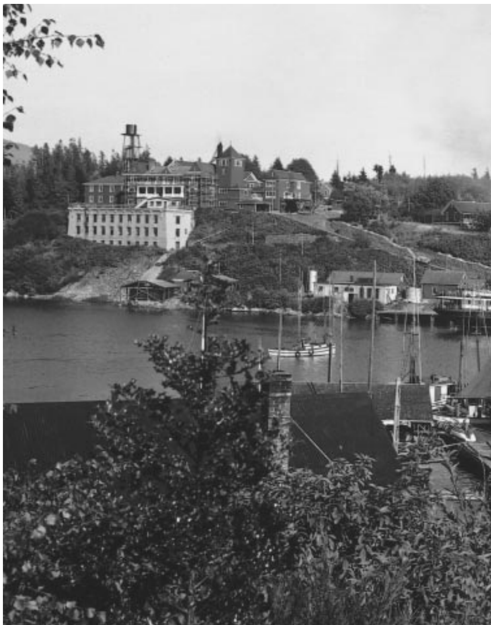
Bamfield in 1948, looking east across Bamfield Inlet to the Trans-Pacific Cable Station, left background. To its right is the Princess Maquinna, which brought freight