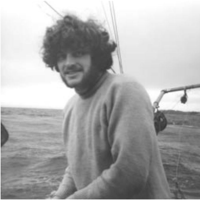
The wild, solitary fish catcher.

I'm slothful. The reasons are more involved. Each line is 180 feet long and wound onto its own "gurdy" — a large bronze spool. The fishing line is stainless steel, about half as thick as coat-hanger wire (and very flexible). To let out a line, I push a lever on its gurdy. The lever engages a belt that's running all the time on the boat's motor. Out goes the line, at a controlled pace. But the first