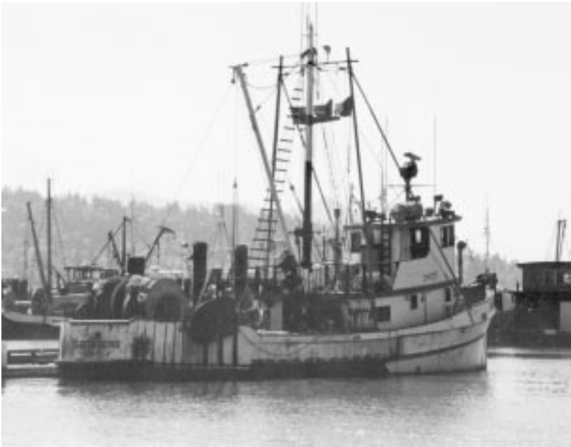
Dragger/Trawler

This is the brute-force end of fishing. A boat with stupendous horsepower drags along an immense net that's open at the front like a scoop. The net might be dragged along the sea bottom, or at any higher level. Sometimes 20,000 pounds of fish at a time are caught (yes, 10 tons; it's a heap). Compare that with maybe two tons for a whole week's fishing on Joy II .