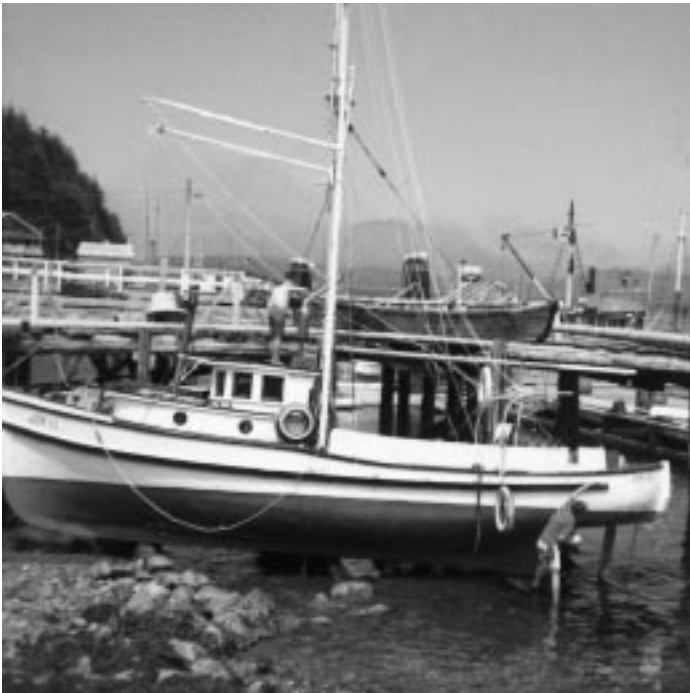
Joy II gets a clean-up.

I navigate by magnetic compass (this was 1964). A depth-sounder tells me how deep the bottom is. But it doesn’t alert me