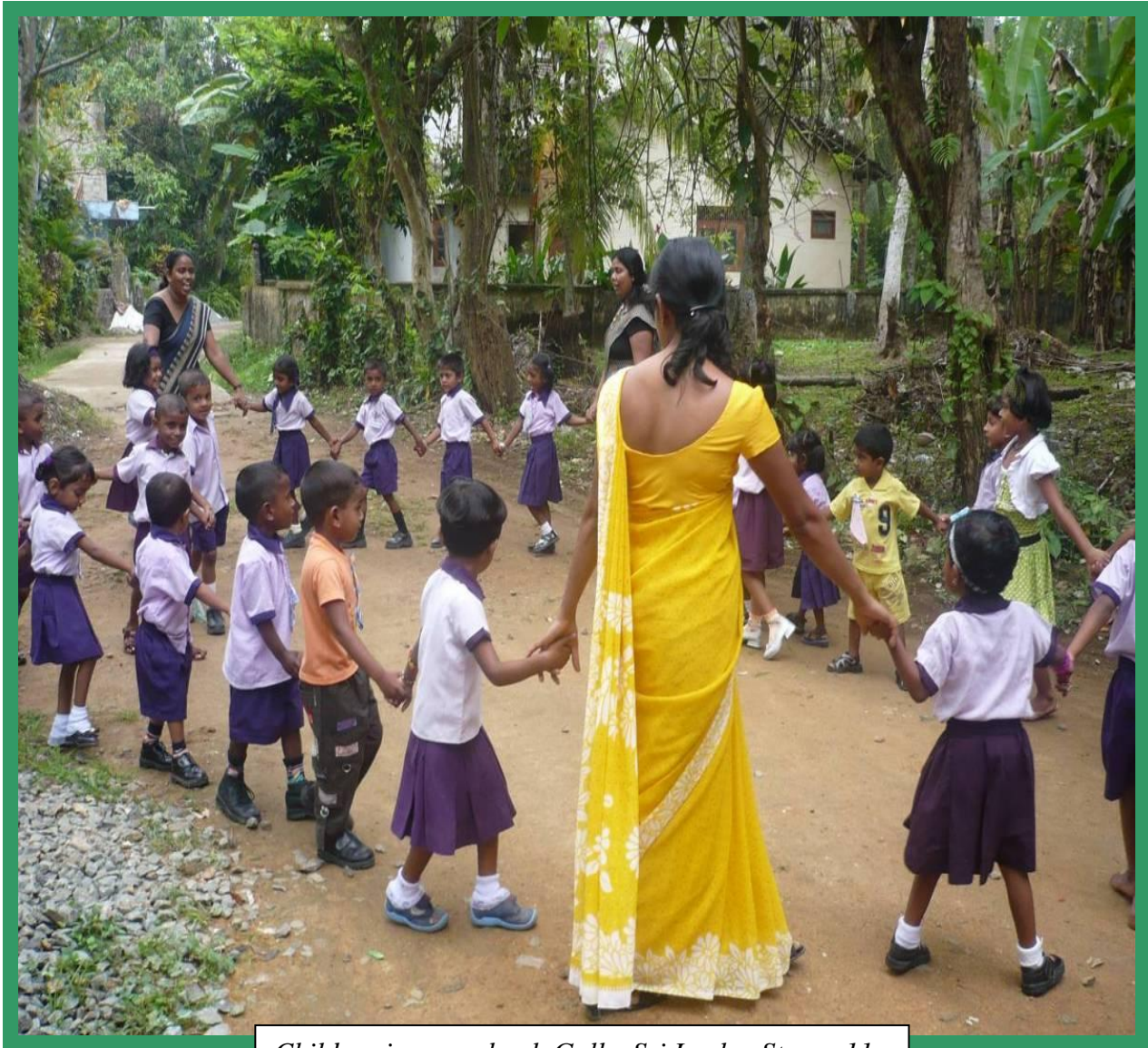
Children in pre-school, Galle, Sri Lanka. Story p11