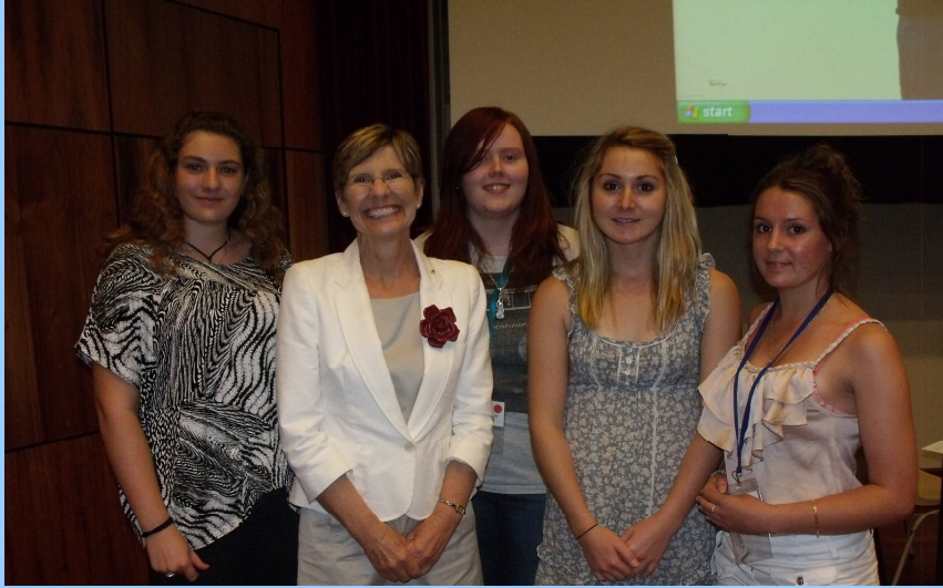
Graduate Women WA WASESS 2011 winners.....see p5.