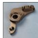
(B4028) 6061 Aluminium, Black Anodized, Right Side for Flat/Flanged Sliding Dropout, Hanger, Shimano 142 x 12 Skewer