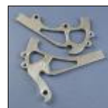
(DR2031) 4130 Steel, Low Mount, Eyelets, Long 6061 Aluminium Hanger