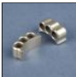
(CS1313) 17/4 Stainless Steel 1 1/4" Mitre, All Holes