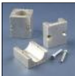
(FT4011) 1 1/8" Bore x 2" Square