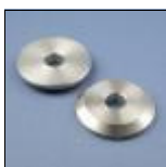
(FT1020) Tapered Washer, 1/2" Hole