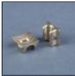
(CS0113) CP Titanium, Zip-Tie, 1 1/4" Mitre