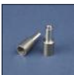
(BK2025) 4130 Steel, Brake Boss, Cantilever