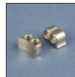
(CS0206) CP Titanium, 1 1/2" Mitre, 2 Holes