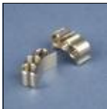
(CS0307) CP Titanium, Front, 1 1/4" Mitre, 2 Slots, Hole