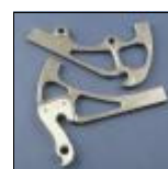
(DR0037) 6-4 Titanium, Low Mount, No Eyelets, Long 7075 Aluminium Hanger