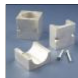
(FT4020) 1 5/8" Bore