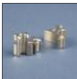
(CS0319) CP Titanium, Rear, 1 3/8" Mitre, 2 Slots, Zip-Tie