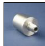
(FT1008) Purge Plug, 1 1/2"