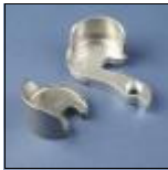
(DR2001) 1018 Steel, Rear, Wright, 1 1/2" x 1.040", Short 6061 Bare Aluminium Hanger