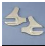
(DR0013) 6-4 Titanium, Rear, Horizontal, Re- lieved, 70 Degree, One Speed