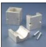
(FT4016) 1 1/2" Bore