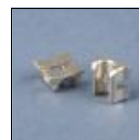
(CS1115) 303 Stainless Steel Zip-Tie, 1 1/2" Mitre