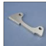
(BK2008) 1018 Steel ISO Calliper Mount, for 1 1/2" Round, Rear Dropouts and 135 x 10, Mitred