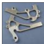
(DR0030) 6-4 Titanium, Low Mount, Eyelets, Short 6061 Aluminium Hanger