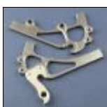
(DR0032) 6-4 Titanium, Low Mount, Eyelets, Short 7075 Aluminium Hanger