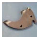
(B4026) 6061 Aluminium, Black Anodized, Left Side for Rocker Dropout, Post Mount for 160 Rotors