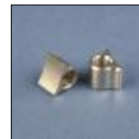
(CS0126) CP Titanium, 1 1/2" Mitre, Hole