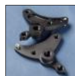
6061 Aluminium, Black Anodized, Right Side Insert for Rocker Dropout, Hanger, DT Swiss 142 x 12 Skewer