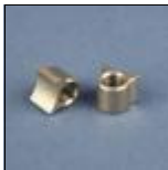
(CS0121) CP Titanium, 5/8" Mitre, Hole