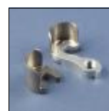
(DR0023) 6-4 Titanium, Rear, Wright, 1 1/8" x 1", Short 6061 Aluminium Hanger