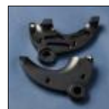
(B4029) 6061 Aluminium, Black Anodized, Left Side Insert for Rocker Dropout, Post Mount, DT Swiss and Shimano 142 x 12 Skewer