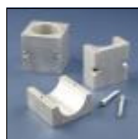
(FT4018) 1 9/16" Bore