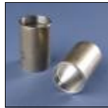
(BB2006) BB30 x 73 mm Steel