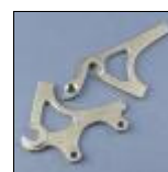
(DR0019) 6-4 Titanium, Rear, Disc Brake, 58 Degree