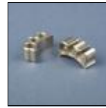
(CS2308) 1018 Steel, Rear, 1 1/4" Mitre, 2 Slots, Hole