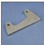
(BK2006) 1018 Steel ISO Calliper Mount, Universal, 1/4", Hi/Lo