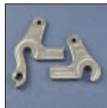
(DR2008) 4130 Steel, Rear, Reynolds Carbon Fiber, 70 Degree