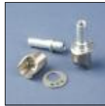
(BK0008) 6-4 Titanium, Brake Boss, 3/4" Mitre Stainless Steel Ring Steel Post