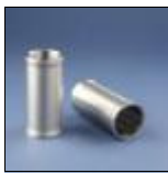
(HT2005) 4130 Steel Head tube, 105 mm