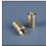
(MS0003) CP Titanium 5 x .8 Binder