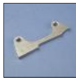
(BK0006) CP or 6-4 Titanium, ISO Calliper Mount, for 1 1/2" Round, Rear Dropouts and 135 x 10, Mitred