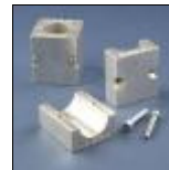
(FT4010) 1 1/8" Bore x 1 3/4" Square