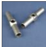
(BK2002) 1018 Steel Brake Bridge, 64 mm No Mitre