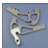
(DR2036) 4130 Steel, Low Mount, No Eyelets, Short 7075 Aluminium Hanger