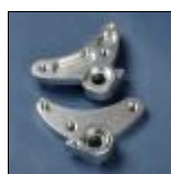
(DR4031) 6061 Aluminium, Right Side Insert for Rocker Dropout, No Hanger, Shimano 142 x 12 Skewer