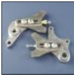
(DS1017) 17-4 Stainless Steel, Flat Sliding, MAXLE, Aluminium Inserts