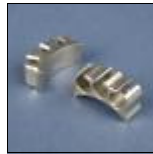
(CS1302) 303 Stainless Steel 1 3/8" Mitre