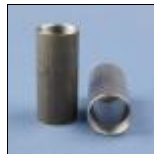
(BB2009) 1.500" x 83.5 mm 1.370" x 24 Right & Left Hand Thread 4130 Steel