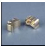
(CS0201) CP Titanium, 7/8" Mitre