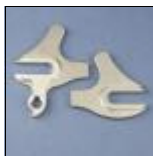
(DR0015) 6-4 Titanium, Rear, Horizontal, Re- lieved, 70 Degree, Hanger