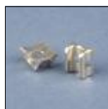
(CS1112) 303 Stainless Steel Zip-Tie, 7/8" Mitre