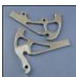
(DR2035) 4130 Steel, Low Mount, No Eyelets, Long 6061 Aluminium Hanger