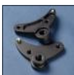
(B4043) 6061 Aluminium, Black Anodized, Right Side Insert for Rocker Dropout, No Hanger, DT Swiss 142 x 12 Skewer