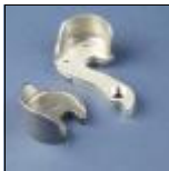
(DR2004) 1018 Steel, Rear, Wright, 1 1/2" x 1.040", Long 7075 Clear Anodized Aluminium Hanger