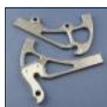
(DR0036) 6-4 Titanium, Low Mount, No Eyelets, Short 7075 Aluminium Hanger