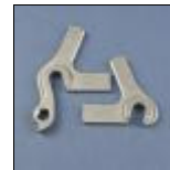
(DR2006) 4130 Steel, Rear, Relieved, 58 Degree