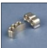
(CS0313) CP Titanium, 1 1/4" Mitre, All Holes