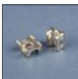
(CS0110) CP Titanium, Zip-Tie, 5/8" Mitre