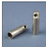
(CS2030) 1018 Steel, Cantilever, Threaded