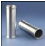
(HT2014) 4130 Steel Head tube, 150 mm