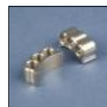
(CS0315) CP Titanium, 1 1/2" Mitre, All Holes