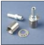
(BK0007) 6-4 Titanium, Brake Boss, No Mitre Stainless Steel Ring Steel Post