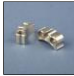
(CS2307) 1018 Steel, Front, 1 1/4" Mitre, 2 Slots, 1018 Steel, Rear, 1 1/4" Mitre, 2 Slots, Hole