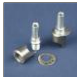
(BK2023) 4130 Steel, Brake Boss, 5/8" Mitre Steel Ring Steel Post