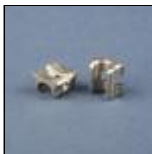
(CS2023) 1018 Steel, Zip-Tie, Small Mitre