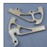
(DR0034) 6-4 Titanium, Low Mount, No Eyelets, Short 6061 Aluminium Hanger