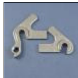
(DR2005) 4130 Steel, Rear, Relieved, 45 Degree