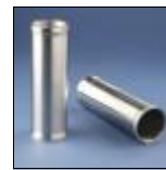
(HT2010) 4130 Steel Head tube, 130 mm