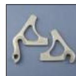
(DR2040) 4130 Steel, Rear, Relieved, 58 Degree, Window