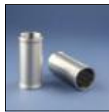
(HT2007) 4130 Steel Head tube, 115 mm