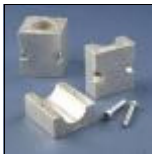
(FT4008) 1" Bore x 3/4" Square