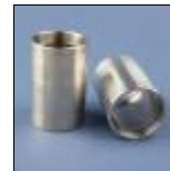
(BB0020) BB30 x 73 mm CP Titanium