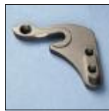
(B4006) 6061 Aluminium, Black Anodized, Right Side for Flat/Flanged Sliding Dropout, Hanger