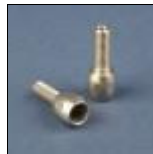
(CS1013) 303 Stainless Steel Cable Adjuster, STI