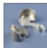
(DR0004) 6-4 Titanium, Round, Rear, Wright, 1 1/2" x 1.040", Short 6061 bare Aluminium Hanger