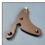
(B4015) 6061 Aluminium, Black Anodized, Right Side for Rocker Dropout, Hanger