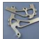
(DR0031) 6-4 Titanium, Low Mount, Eyelets, Long 6061 Aluminium Hanger