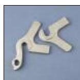
(DR0009) 6-4 Titanium, Rear, Relieved, 58 Degree