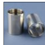
(BB0029) BB0029 - PF30 x 73 mm x 2" 6/4 Titanium