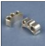
(CS1308) 17/4 Stainless Steel Rear, 1 1/4" Mitre, 17/4 Stainless Steel Front, 1 3/8" Mitre, 2 Slots, Hole