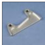
(BK2007) 1018 Steel ISO Calliper Mount, Universal, Hi/Lo, Light