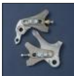
(DS1043) 17-4 Stainless Steel, Flat, No Hanger, Post Mount, 142 x 12 Skewer, 6061 Aluminium Insert