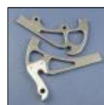
(DR2037) 4130 Steel, Low Mount, No Eyelets, Long 7075 Aluminium Hanger