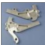
(DR0029) 6-4 Titanium, Low Mount, Eyelets, Expedition, Long 7075 Aluminium Hanger