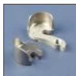
(DR0006) 6-4 Titanium, Rear, Wright, 1 1/2" x 1.040", Short 7075 Clear Anodized Aluminium Hanger