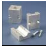
(FT4004) 3/4" Bore