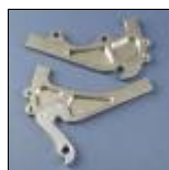
(DR0027) 6-4 Titanium, Low Mount, Eyelets, Expedition, Long 6061 Aluminium Hanger