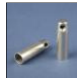
(CS1022) 303 Stainless Steel Threaded, Rear, Cantilever