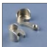
(DR0003) 6-4 Titanium, Rear, Wright, 1 3/8" x 1.040", Long Integral Hanger