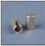
(CS1001) Round, 5/16", Slot, Mitre