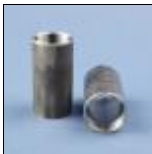
(BB2008) 1.500" x 73.5 mm 1.370" x 24 Right & Left Hand Thread 4130 Steel