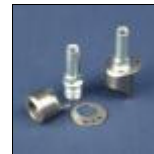
(BK2020) Steel, Brake Boss, 3 Piece, 3/4" Mitre Stainless Steel Ring Steel Post