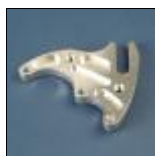
(DR4017) 6061 Aluminium, Left Side for Rocker Dropout, Rohloff