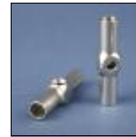
(BK1002) 304 Stainless Steel Brake Bridge, 58 mm, No Mitre