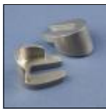
(DR0012) CP Titanium, Rear, Horizontal, Flanged, One Speed