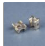
(CS0112) CP Titanium, Zip-Tie, 7/8" Mitre