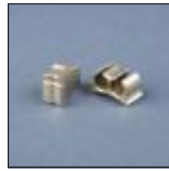
(CS2201) 1018 Steel, 1 3/8" Mitre