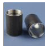
(BB2031) PF30 x 74 mm x 2" 4130 Steel