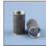
(BB2007) 1.500" x 68.5 mm 4130 Steel