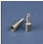
(BK1025) 304 Stainless Steel, Brake Boss, Cantilever