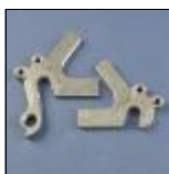
(DR0044) 6-4 Titanium, Rear, 58 Degree, Eyelets