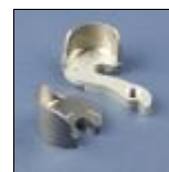
(DR0007) 6-4 Titanium, Rear, Wright, 1 1/2" x 1.040", Long 7075 Clear Anodized Aluminium Hanger