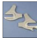
(DR0014) 6-4 Titanium, Rear, Horizontal, Re- lieved, 70 Degree, Opener