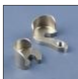
(DR0001) 6-4 Titanium, Rear, Wright, 1 3/8" x 1.040", Short Integral Hanger