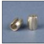
(CS1007) 304 Stainless Steel Round, 3/8", Slotted, Barrel, 6 mm Hole, Mitre