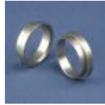
(MS2004) 1020 Steel Crown Race, 1 1/8"