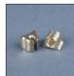
(CS0106) CP Titanium, 1 1/2" Mitre