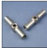
(BK0003) 6-4 Titanium, Brake Bridge, 64 mm No Mitre