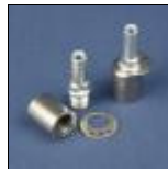
(BK2019) Steel, Brake Boss, No Mitre Stainless Steel Ring Steel Post