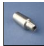
(FT0003) Purge Plug, 7/8"