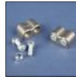
(MS0004) CP Titanium 5 x .8 Double Binder