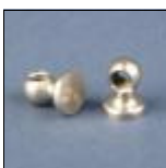
(CS1023) 303 Stainless Steel Chain Stay Mount