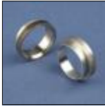
(MS2003) 4130 Steel Crown Race, 1"