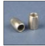
(CS1008) 304 Stainless Steel Round, 3/8" OD, Barrel, 6 mm Through Hole, Mitred