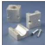
(FT4009) 1" Bore x 2" Square