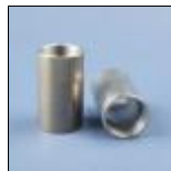
(BB2012) 1.562" x 73.5 mm 1.370" x 24 Right & Left Hand Thread 1020 Steel