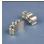
(CS0308) CP Titanium, Rear, 1 1/4" Mitre, 2 Slots, Hole