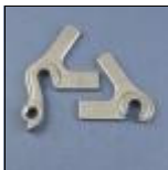
(DR2007) 4130 Steel, Rear, Relieved, 70 Degree