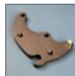
(B4016) 6061 Aluminium, Black Anodized, Left Side for Rocker Dropout, ISO Mount