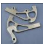
(DR0035) 6-4 Titanium, Low Mount, No Eyelets, Long 6061 Aluminium Hanger