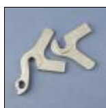
(DR0008) 6-4 Titanium, Rear, Relieved, 70 Degree