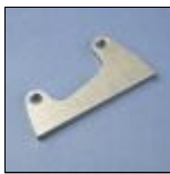
(BK0004) CP or 6-4 Titanium, ISO Calliper Mount, Universal, Hi/Lo