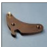
(B4014) 6061 Aluminium, Black Anodized, Right Side for Rocker Dropout, No Hanger,