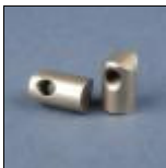
(CS1019) 17/4 or 304 Stainless Steel Down Tube, 3/8", STI, Mitre