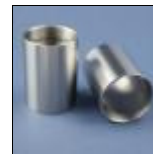
(BB2028) PF30 x 68 mm x 1 15/16" 4130 Steel