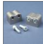
(MS2020) 1018 Steel Double Binder