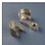
(DR2023) 1018 Steel, Rear, Wright, 1 1/8" x 22 mm, Short 6061 Aluminium Hanger