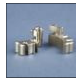
(CS0318) CP Titanium, Front, 1 3/8" Mitre, 2 Slots, Zip-Tie