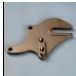
(B4009) 6061 Aluminium, Black Anodized, Left Side for Flanged Sliding Dropout, ISO Mount