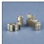
(CS0320) CP Titanium, Front, 1 1/2" Mitre, 2 Slots, Zip-Tie