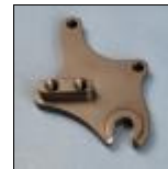
(B4010) 6061 Aluminium, Black Anodized, Left Side for Flanged Sliding Dropout, ISO Mount, Rohloff