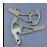
(DR2034) 4130 Steel, Low Mount, No Eyelets, Short 6061 Aluminium Hanger