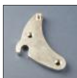
(DR4014) 6061 Aluminium, Right Side for Rocker Dropout, No Hanger