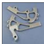
(DR2030) 4130 Steel, Low Mount, Eyelets, Short 6061 Aluminium Hanger