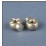
(CS1021) 304 Stainless Steel STI Ball Stop