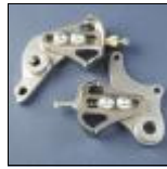
(DS0018) 6-4 Titanium, Flanged Sliding, MAXLE