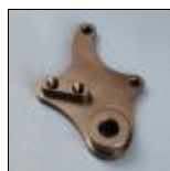
(B4012) 6061 Aluminium, Black Anodized, Left Side for Flanged Sliding Dropout, MAXLE