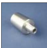
(FT1006) Purge Plug, 1 1/4"