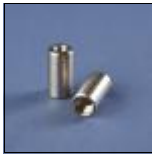
(MS0001) CP Titanium 6 x 1 Binder