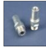
(BK2015) 1144 Steel Brake Stud, Paul Component Brakes Zink Plated