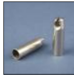
(CS2015) 1018 Steel, Rear, Cantilever