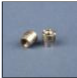
(CS2002) 1018 Steel, Head Tube Shift Boss