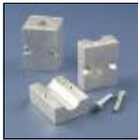
(FT4002) Tube Block, 5/8" Bore