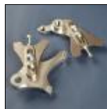
(DS1082) 17-4 Stainless Steel, Flat, Hanger, Post Mount, DT Swiss 142 x 12 Skewer