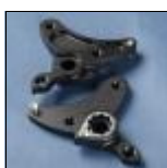
(B4030) 6061 Aluminium, Black Anodized, Right Side Insert for Rocker Dropout, Hanger, Shimano 142 x 12 Skewer