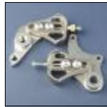
(DS1018) 17-4 Stainless Steel, 0.740" Flanged Sliding, MAXLE, Aluminium Inserts