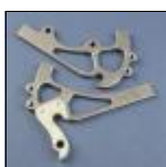
(DR2032) 4130 Steel, Low Mount, Eyelets, Short 7075 Aluminium Hanger