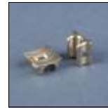
(CS0115) CP Titanium, Zip-Tie, 1 1/2" Mitre