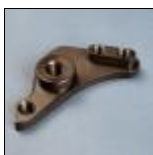
(B4011) 6061 Aluminium, Black Anodized, Right Side for Flat/Flanged Sliding Dropout, MAXLE, Hanger