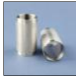
(BB0002) 1.500" x 68.0 mm, Knurled 1.370" x 24 Right & Left Hand Thread Titanium