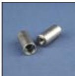
(MS2001) 4130 Steel 6 x 1 Binder