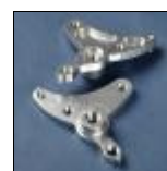
(DR4042) 6061 Aluminium, Right Side Insert for Rocker Dropout, Hanger, DT Swiss 142 x 12 Skewer