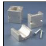
(FT4014) 1 3/8" Bore