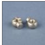
(CS2021) 1018 Steel, STI Ball Stop