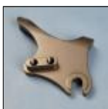
(B4025) 6061 Aluminium, Black Anodized, Left Side for Flat/Flanged Sliding Dropout, Post Mount for 160 Rotors