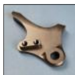
(B4027) 6061 Aluminium, Black Anodized, Left Side for Flat/Flanged Sliding Dropout, Post Mount, Shimano/DT Swiss 142 x 12 Skewer