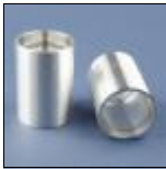
(BB4001) BB30 x 68 6061 Aluminium