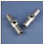
(BK2001) 1018 Steel Brake Bridge, 58 mm No Mitre