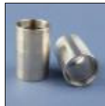
(BB0019) BB30 x 68 CP Titanium