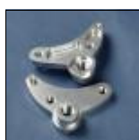
(DR4043) 6061 Aluminium, Right Side Insert for Rocker Dropout, No Hanger, DT Swiss 142 x 12 Skewer