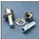
(BK2021) 4130 Steel, Brake Boss, 5/8" Mitre, On Centre Steel Ring Steel Post