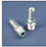
(BK2014) 1144 Steel Brake Stud, Pre-2008 Shimano Zink Plated