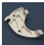
(DR4026) 6061 Aluminium, Left Side for Rocker Dropout, Post Mount