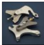
(DS1023) 17-4 Stainless Steel, Flat Sliding, Hanger, Post Mount