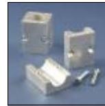
(FT4006) 7/8" Bore