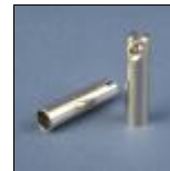
(CS1015) 17/4 or 304 Stainless Steel Rear, Cantilever