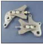
(DS0017) 6-4 Titanium, Flat Sliding, MAXLE