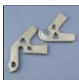
(DR0021) 6-4 Titanium, Rear, Relieved, 49 Degree, Short Hanger