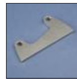
(BK2005) 1018 Steel ISO Calliper Mount, Universal, 3/16", Hi/Lo