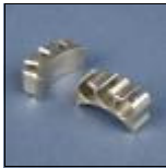
(CS1301) 303 Stainless Steel 1 1/4" Mitre