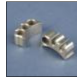
(CS1307) 17/4 Stainless Steel Front, 1 1/4" Mitre, 2 Slots, Hole