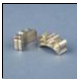
(CS0301) CP Titanium, 1 1/4" Mitre