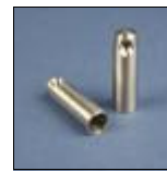
(CS0022) CP Titanium, Threaded, Rear, Cantilever