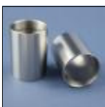
(BB2029) PF30 x 73 mm x 1 15/16" 4130 Steel