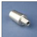
(FT1004) Purge Plug, 1"