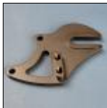
(B4008) 6061 Aluminium, Black Anodized, Left Side for Flat Sliding Dropout, ISO Mount, Rohloff