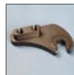
(B4013) 6061 Aluminium, Black Anodized, Left Side for Flat Sliding Dropout, Without ISO Mount