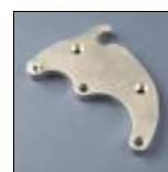
(DR4016) 6061 Aluminium, Left Side for Rocker Dropout, ISO Mount