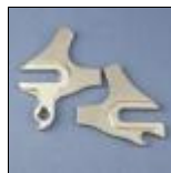
(DR0016) 6-4 Titanium, Rear, Horizontal, Re- lieved, 70 Degree, Opener/Hanger