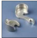
(DR2002) 1018 Steel, Rear, Wright, 1 1/2" x 1.040", Long 6061 Bare Aluminium Hanger