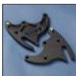
(B4017) 6061 Aluminium, Black Anodized, Left Side for Rocker Dropout, ISO Mount, Rohloff