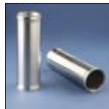
(HT2018) 4130 Steel Head tube, 170 mm