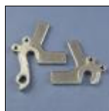
(DR0045) 6-4 Titanium, Rear, 70 Degree, Eyelets