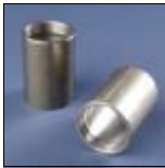
(BB2005) BB30 x 68 mm Steel