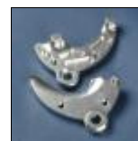
(DR4029) 6061 Aluminium, Left Side Insert for Rocker Dropout, Post Mount, Shimano and DT Swiss 142 x 12 Skewer