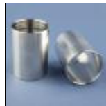
(BB1028) PF30 x 68 mm x 1 15/16" 17/4 Stainless Steel