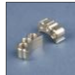
(CS0309) CP Titanium, Front, 1 3/8" Mitre, 2 Slots, Hole