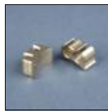
(CS0202) CP Titanium, 1 1/4" Mitre