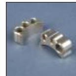
(CS1310) 17/4 Stainless Steel Rear, 1 3/8" Mitre, 2 Slots, Hole