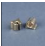
(CS0101) CP Titanium, 5/8" Mitre