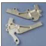
(DR0026) 6-4 Titanium, Low Mount, Eyelets, Expedition, Short 6061 Aluminium Hanger