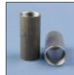
(BB2010) 1.500" x 100.5 mm 1.370" x 24 Right & Left Hand Thread 4130 Steel