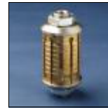
(FT5004) Heat sink/Purge Fitting for PF30 Bot- tom Bracket Shell