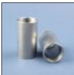
(BB2011) 1.562" x 68.5 mm 1.370" x 24 Right & Left Hand Thread 1020 Steel