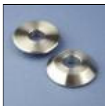
(FT0013) Tapered Washer