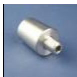
(FT1007) Purge Plug, 1 3/8"