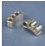
(CS1309) 17/4 Stainless Steel Front, 1 3/8" Mitre, 17/4 Stainless Steel Rear, 1 3/8" Mitre, 2 Slots, Hole