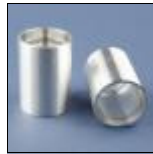
(BB4002) BB30 x 73 mm 6061 Aluminium