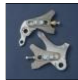
(DS1042) 17-4 Stainless Steel, Flat, Hanger, Post Mount, 142 x 12 Skewer, 6061 Alumin- ium Insert