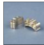
(CS0303) CP Titanium, Triple, 1 1/2" Mitre