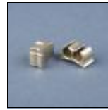
(CS2202) 1018 Steel, 1 1/2" Mitre