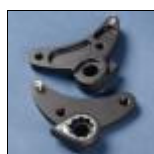
(B4031) 6061 Aluminium, Black Anodized, Right Side Insert for Rocker Dropout, No Hanger, Shimano 142 x 12 Skewer