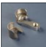
(DR2022) 1018 Steel, Rear, Wright, 1 1/8" x 22 mm, Long 6061 Aluminium Hanger