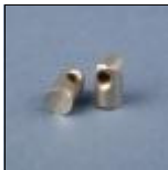
(CS2019) 1018 Steel, Down Tube, 3/8", STI, Mitre