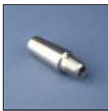
(FT0001) Purge Plug, 5/8"