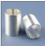
(BB4004) PF30 x 73 mm 6061 Aluminium