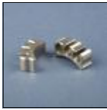
(CS2301) 1018 Steel, 1 1/4" Mitre