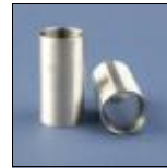
(BB1018) 1.500" OD x 100 mm 17/4 Stainless Steel