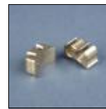
(CS0203) CP Titanium, 1 3/8" Mitre