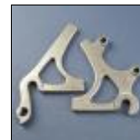
(DR2010) 4130 Steel, Rear, Disc, Relieved