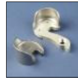
(DR2003) 1018 Steel, Rear, Wright, 1 1/2" x 1.040", Short 7075 Clear Anodized Aluminium Hanger