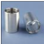
(BB1019) BB30 x 68 mm 17/4 Stainless Steel