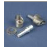
(BK2024) 4130 Steel, Brake Boss, 1" Mitre Steel Ring Steel Post