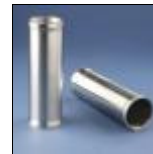
(HT2020) 4130 Steel Head tube, 190 mm