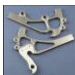
(DR0033) 6-4 Titanium, Low Mount, Eyelets, Long 7075 Aluminium Hanger