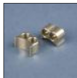
(CS0205) CP Titanium, 7/8" Mitre, 2 Holes