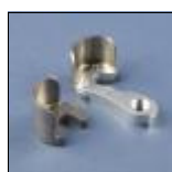
(DR0022) 6-4 Titanium, Rear, Wright, 1 1/8" x 1", Long 6061 Aluminium Hanger