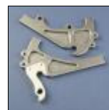
(DR2028) 4130 Steel, Low Mount, Eyelets, Expedition Model, Short 7075 Aluminium Hanger