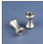
(MS2002) 1018 Steel Hourglass Binder