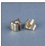
(CS0104) CP Titanium, 1 1/4" Mitre