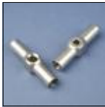
(BK0002) 6-4 Titanium, Brake Bridge, 58 mm No Mitre