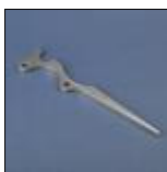
(BK2009) 1018 Steel ISO Calliper Mount, Willits