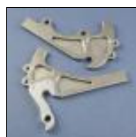
(DR2027) 4130 Steel, Low Mount, Eyelets, Expedition Model, Long 6061 Aluminium Hanger