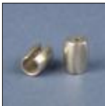
(CS1009) 304 Stainless Steel Round, 3/8" OD, Slotted, Barrel, 6.5 mm Hole, Mitred