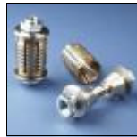
(FT5003) BB30 Heat sink and Purge Fitting