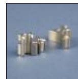
(CS0321) CP Titanium, Rear, 1 1/2" Mitre, 2 Slots, Zip-Tie