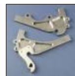
(DR0028) 6-4 Titanium, Low Mount, Eyelets, Expedition, Short 7075 Aluminium Hanger