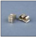
(CS2200) 1018 Steel, 1 1/4" Mitre