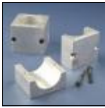
(FT4022) 1 3/4" Bore