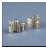
(CS0317) CP Titanium, Rear, 1 1/4" Mitre, 2 Slots, Zip-Tie