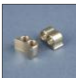
(CS0207) CP Titanium, 1 1/4" Mitre, 2 Holes