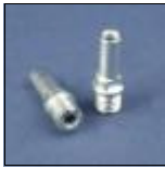
(BK2013) 1144 Steel Brake Stud, 2008 Shimano Zink Plated