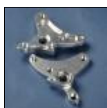
(DR4030) 6061 Aluminium, Right Side Insert for Rocker Dropout, Hanger, Shimano 142 x 12 Skewer