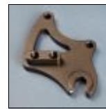
(B4007) 6061 Aluminium, Black Anodized, Left Side for Flat Sliding Dropout, ISO Mount