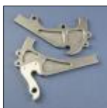
(DR2029) 4130 Steel, Low Mount, Eyelets, Expedition Model, Long 7075 Aluminium Hanger