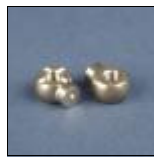
(CS0021) CP Titanium, STI Ball Stop