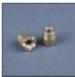
(CS0020) CP Titanium, Head Tube Shift Boss