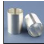
(BB4003) PF30 x 68 mm 6061 Aluminium