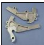
(DR2026) 4130 Steel, Low Mount, Eyelets, Expedition Model, Short 6061 Aluminium Hanger