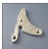
(DR4015) 6061 Aluminium, Right Side for Rocker Dropout, With Hanger