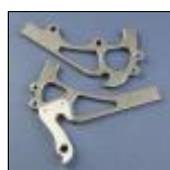
(DR2033) 4130 Steel, Low Mount, Eyelets, Long 7075 Aluminium Hanger