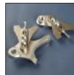
(DS1083) 17-4 Stainless Steel, Flat, No Hanger, Post Mount, DT Swiss 142 x 12 Skewer, 6061 Aluminium Insert