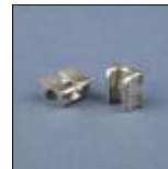
(CS2022) 1018 Steel, Zip-Tie, Large Mitre