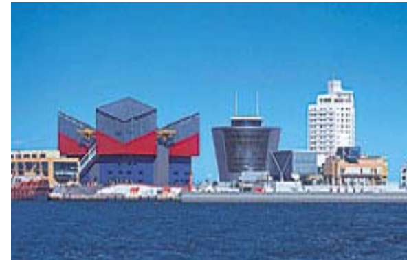
2004 Rotary International Convention Venue - Osaka