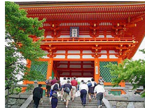
A group of Rotarians walk up the stairs of a Shinto shrine during a pre-convention visit to Kyoto, Japan, 22 May 2004.