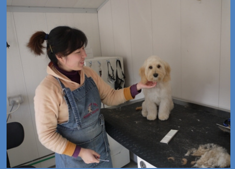
Pictured: Cecelia and Lily.

Mixed-breed dogs usually have behavioral traits similar to the breed they most resemble in appearance.